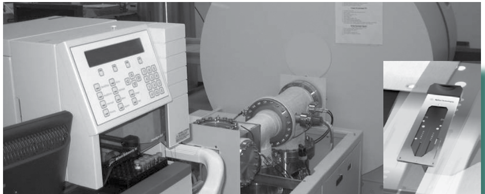
New technologies for previously difficult-to-measure, but important long-chain sugars in milk enable a detailed and comprehensive view of these potential health-promoting components in milk. Long-chain sugars are food for resident intestinal bacteria. This single credit card-like chip (photo inset) separates and measures all 190 different sugars found in breast milk in a single run.

Bioactive ingredients are structures in food that bring about specific physiological/metabolic effects beyond the traditional view of food as fuel sources. The impetus for focus on bioactives is the burden of chronic, metabolic diseases in the population coupled with rising health care costs. This opens the door to new strategies for preventing diseases and promoting health. Research is continuing to identify unique components in milk, define appropriate health targets and find diagnostics that make sense to deliver health benefits. Mammalian milks nourish and promote the (see Milk Bioactives on page 2)